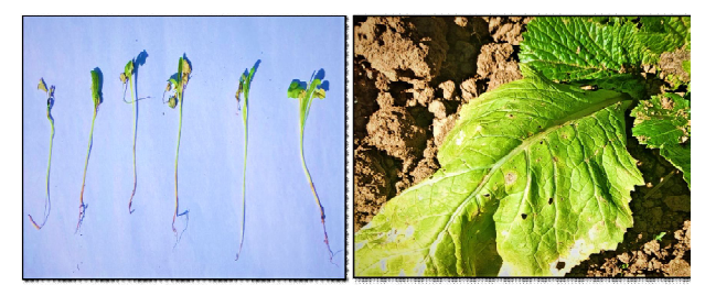
Fig. 4: (A) Damping-off disease of Brassica juncea observed in Nursery (B) Alternaria blight disease of Brassica juncea observed in field

It is evident from the results that all the treatments were effective in increasing the number of primary and secondary branches in both the varieties of mustard. In local variety (Table 5), the number of primary and secondary branches per plant ranged from 5.67 to 10.67 and 7.33 to 12.83 respectively. The maximum primary and secondary branches were recorded in T_4 with 10.67 and 12.83 respectively, followed by T_7 with 9.67 and 11.67 numbers respectively. The minimum primary and